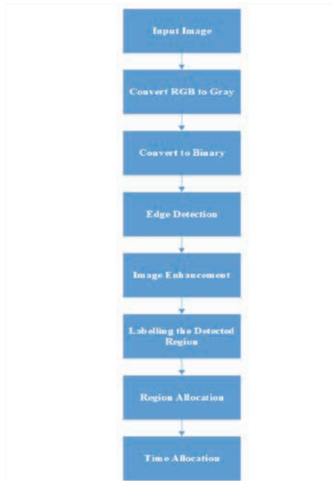
Fig. (4). Otsu's Algorithm