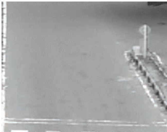
Fig. (6). Reference image

On the basis of stated algorithm, the deep analysis of system has been shown in this section. With help of pictures each and every step of algorithm will be discussed. As discussed, for the system to work properly we have to feed reference image of an empty road, so that pixel density could be compared. Through this only we could identify the regions i.e. low, medium and high. The reference image of the system is shown in Figure 6.