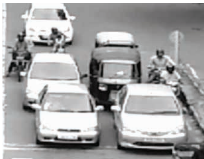
Fig. (7). Input image

One image out of various is shown for analysis in Figure 7.