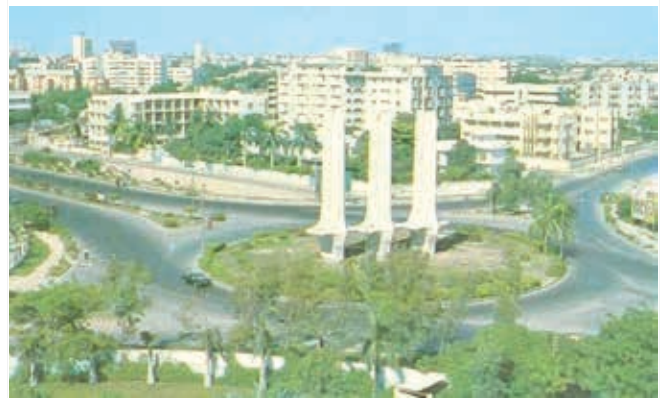
Fig. (3). 3-Talwar, slow day

Whereas, on slow days zero number of cars passing the signal could be seen in Figure 3.