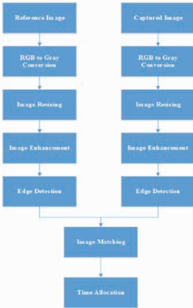
Fig. (1). System description of traffic signal algorithm

The objective of this proposed study is to make the existing system more efficient while utilizing the optimum existing resources by means of automating the traffic light system on the basis of density of traffic. This proposed system is solely based on image processing technique. As previously discussed that system has been design to be implemented on 3-Talwar, Karachi. The 3-Talwar signal is among one of the busiest signals in Karachi, where as per the statistics, 40-50 thousand cars passes daily.