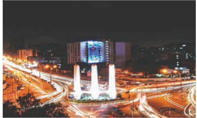
Fig. (2). 3-Talwar, busy day

Keeping in mind such a huge number, one can predict that what could be the condition of traffic there in rush hours. It's a four lane road consisting of 4 main traffic signals on a busy day, the signal looks like as shown in Figure 2.