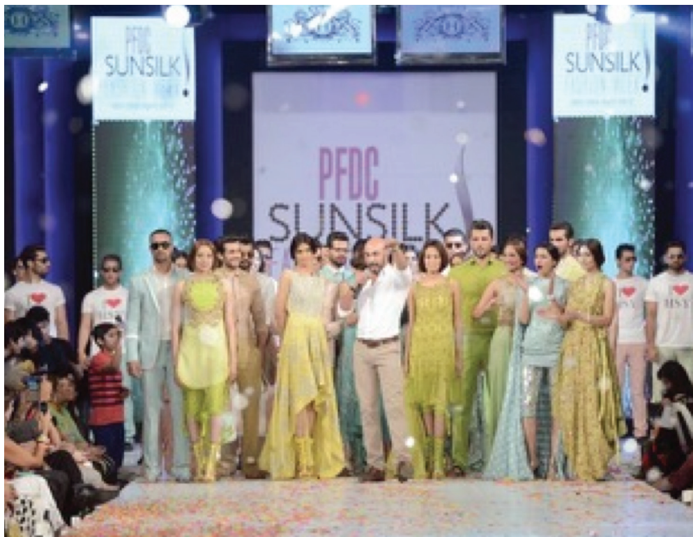
Figure 3: Pakistani designer at a fashion show organized by PFDC

PFDC, with its head office in Lahore, is representing and promoting Pakistani designers at all levels, both domestically and internationally. Regular fashion weeks has been started since February 2010 (PFDC, 2014) to celebrate Pakistani designers in international fashion week circuits in collaboration with multinational corporations like Unilever and L'Oreal. Since its inception, they have successfully held five fashion weeks and two bridal weeks (refer to Figure 4.) attracting high profile international buyers and media. As a result, in September 2011, eight designers from Pakistan were invited to hold the exclusive show at the prestigious Federation Francoise du Prêt, a Porter Feminine in Paris (PFDC, 2014). They have also signed an MOU with World Fashion Organizations and World Fashion Week to become an official representative in Pakistan. Pakistan has always been known for embroideries and PFDC collaborated with Aik Hunar Aik Nagar (AHAN) for the revival of the craft sector by merging traditional embroideries with contemporary designs (Ajmal, 2018). In the arena of retail, they have a Multi-brand outlet with 9,500 square feet at a mall in Lahore stocking 40 designers, another franchised in India. One of the remarkable efforts is the launch of The PFDC Fashion Active (TPFA), a unique retail concept at Mall One in Lahore on February 26, 2016. It's not a