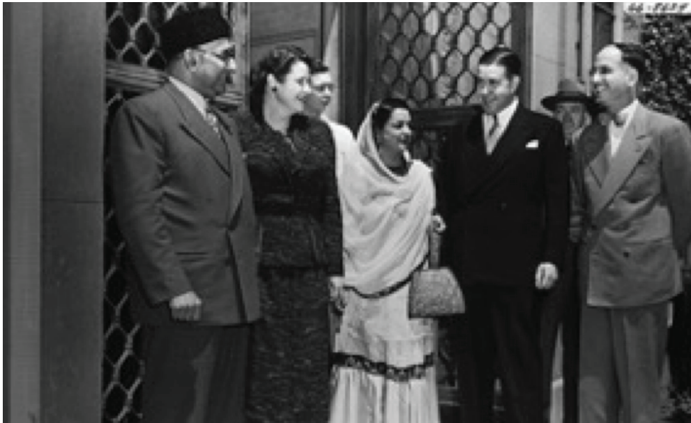
Figure 1: Pakistan First Lady Begum Rana Liaquat Ali Khan wearing traditional clothes at a political convention

Ready to wear can be divided into two categories, prêt à porter and fast fashion. Both target large clientele at affordable prices. Particularly fast fashion requires unique challenges of predicting a trend, planning quantities and inventories for production of quality apparel at affordable prices, following a consumer-based approach (Gabrielli, Baghi, & Codeluppi, 2013).