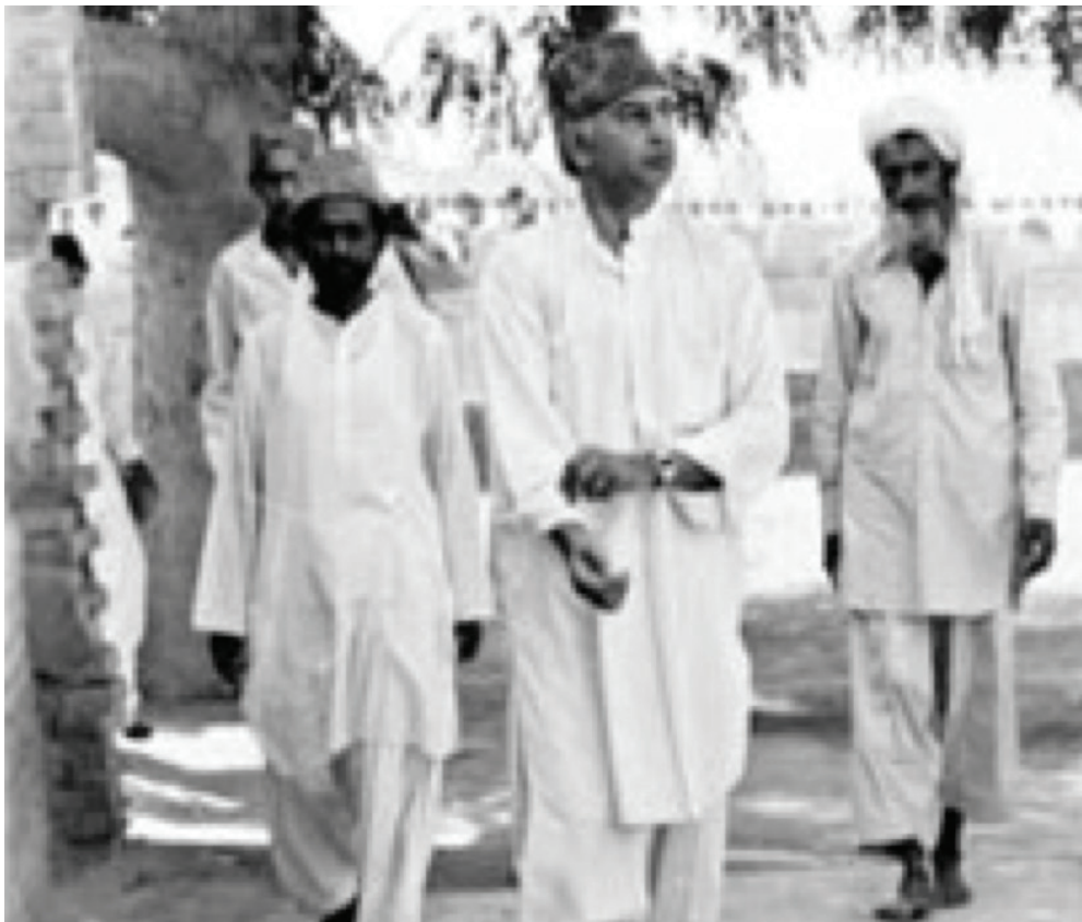
Figure 3: Zulfikar Ali Bhutto wearing shalwar kameez