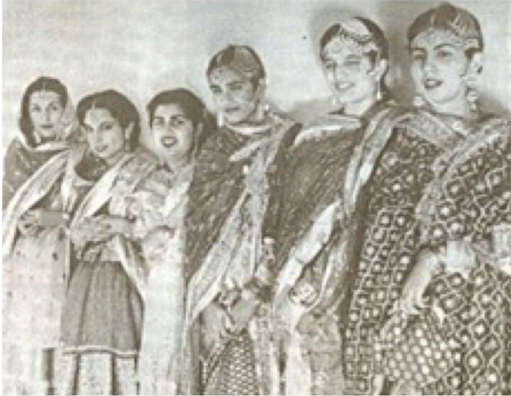
Figure 2: Traditional Fashion Silhouette, gharara & sharara after partition